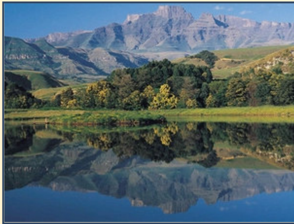
Champagne Castle, Drakensberg (Click on pick for full size)