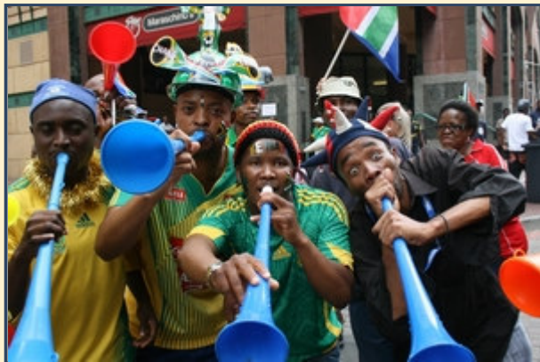
World Cup fans blowing the now world famous vuvuzelas (Click on pick for full size)