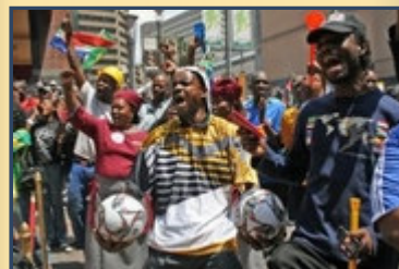
(click on pic for full size) 2010 World Cup fans