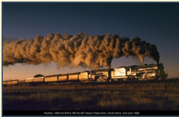
The first rays of morning sun glint from the two Pacific steam locomotives with a train departing Thaba Nchu towards Bloemfontain, South Africa. 2nd June 1998. According to the latest figures,