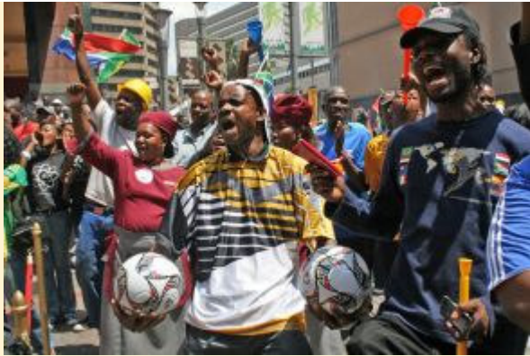
World Cup fans blowing the now world famous vuvuzelas