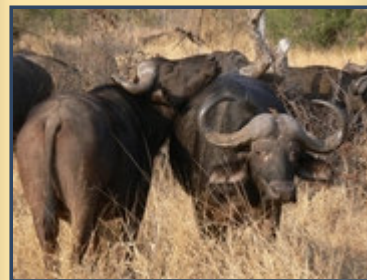
South African Games (click on pic for full size)