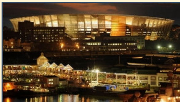
New Cape Town Stadium for FIFA 2010 (click on pic for full size)