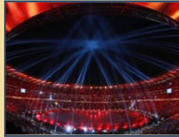
(click on pic for full size) The closing ceremony, prior to the 2010 FIFA World Cup South Africa Final match between Netherlands and Spain at Soccer City Stadium on July 11, 2010 in Johannesburg, South Africa.

As the final whistle blows on Africa's first FIFA World Cup, fans reflect on what they will take away from the historic tournament.