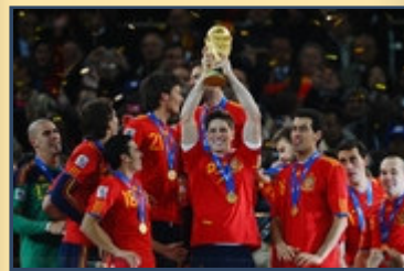
(click on pic for full size) Johannesburg, South Africa Fernando Torres of Spain (C), and the Spain team celebrate victory with the World Cup trophy following the 2010 FIFA World Cup South Africa Final match between Netherlands and Spain at Soccer City Stadium on July 11, 2010 in Johannesburg, South Africa.