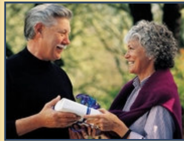
Retired in South Africa